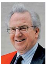
Lord Steward Sutherland , Baron of Houndwood, Member of the House of Lords, UK