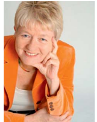
Ilona Kickbusch , Chairperson of the World Ageing & Generations Congress 2009

These are but a few of the intricate and highly relevant questions to be addressed at the WORLD AGEING & GENERATIONS CONGRESS 2009 , which is aimed at a broad audience interested in a comprehensive examination of the effects and consequences of the ever-increasing global population and a continuously ageing society. The congress is therefore as much an educational as a mind-shifting event – an international and interdisciplinary platform used by decision-makers from all spheres of society and by a general audience that is fascinated, intrigued, and concerned about the consequences of global demographic shifts.