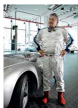
Hans Herrmann (81, legendary racing driver)