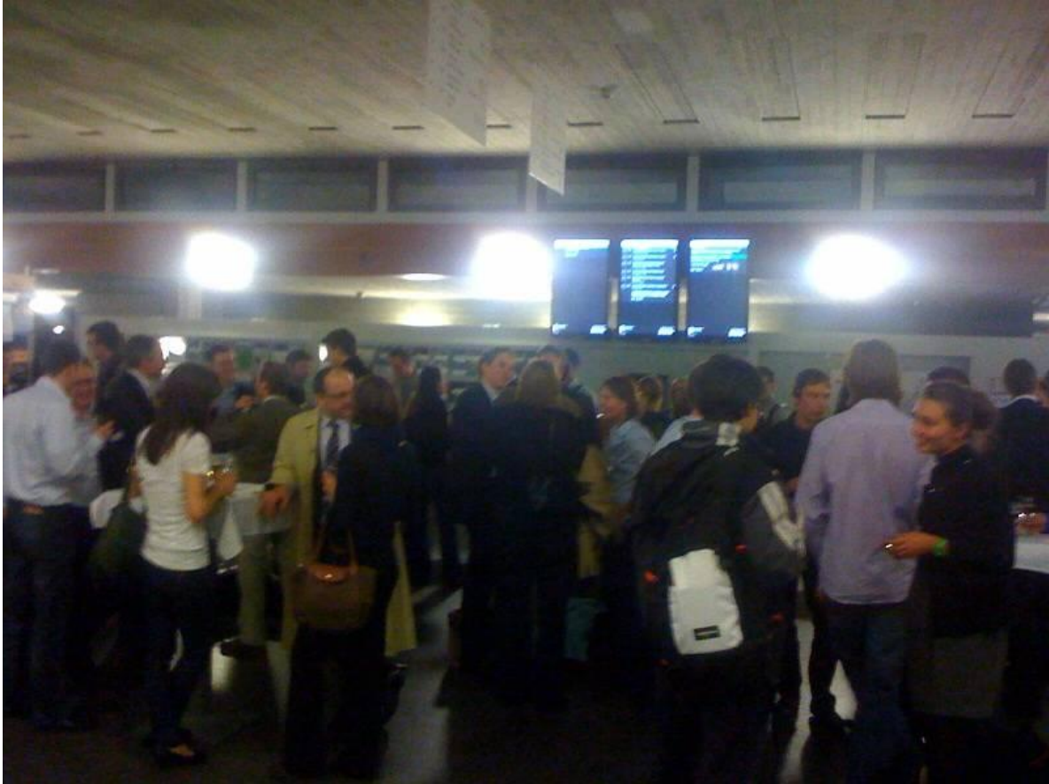
Apero at the event.